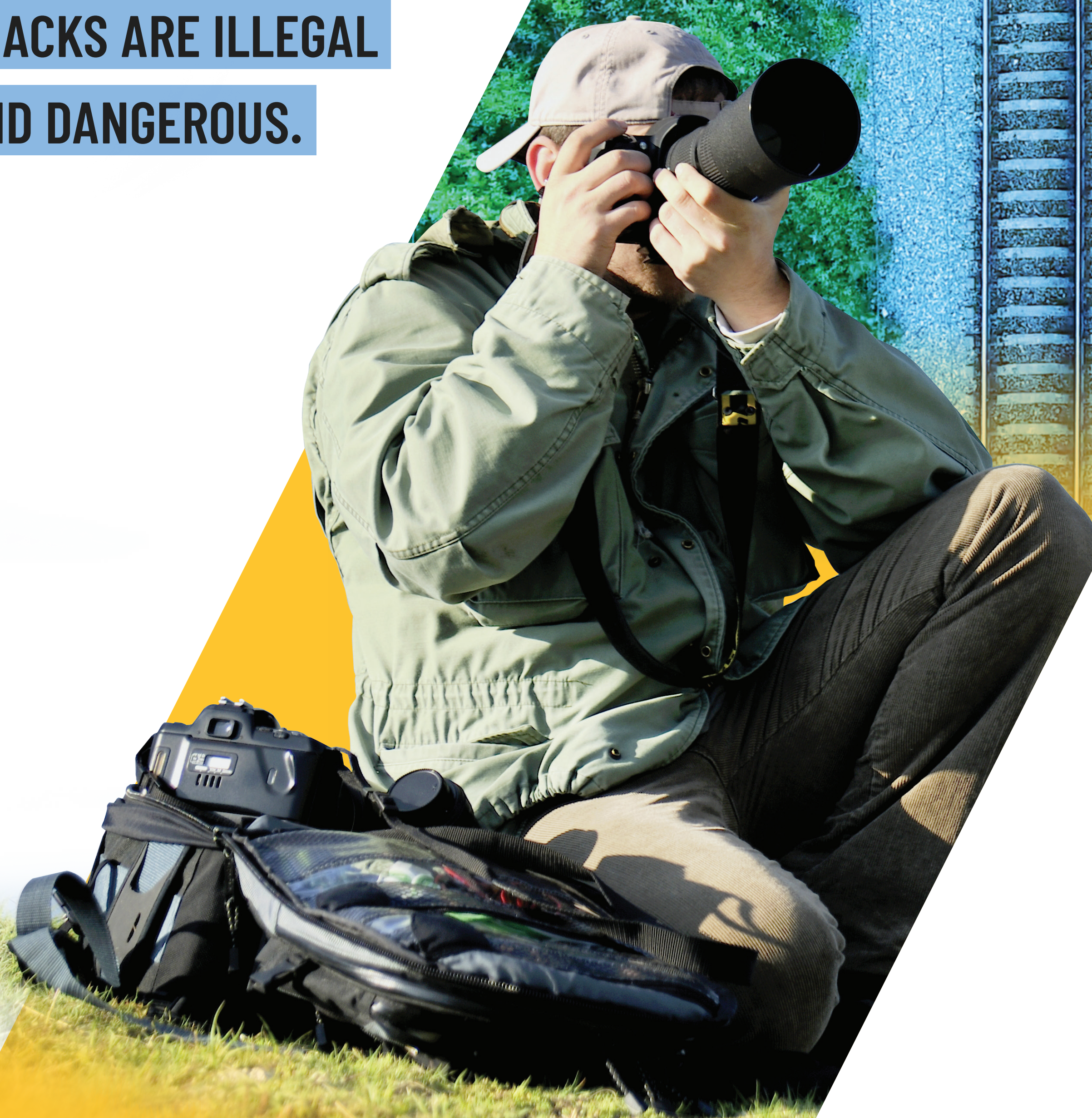
PHOTO AND VIDEO SHOOTS ON OR NEAR RAILROAD TRACKS ARE ILLEGAL AND DANGEROUS.