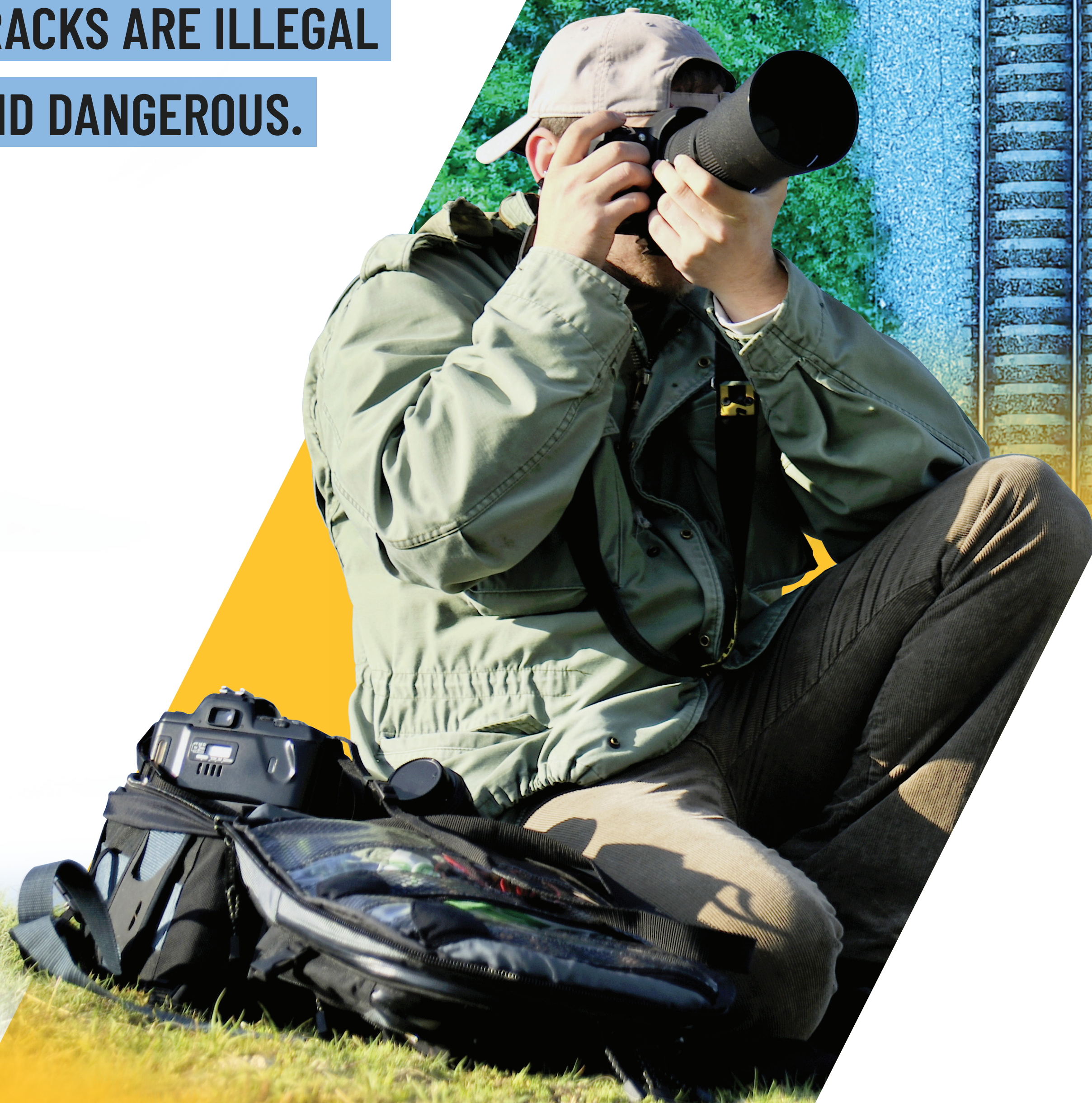
PHOTO AND VIDEO SHOOTS ON OR NEAR RAILROAD TRACKS ARE ILLEGAL AND DANGEROUS.